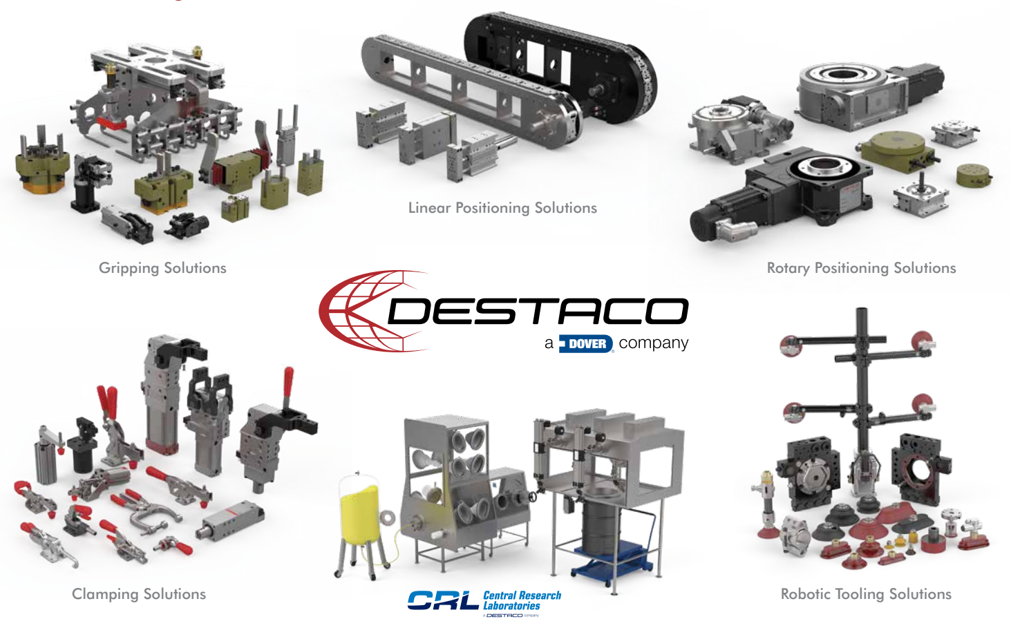
CRL Remote Handling Solutions

DESTACO, a Dover company, is a global leader in the design and manufacture of high-performance automation, workholding and remote-handling solutions. The company serves customers in a variety of end-markets, including the automotive, life sciences, consumer packaged goods, aerospace, industrial and nuclear sectors.