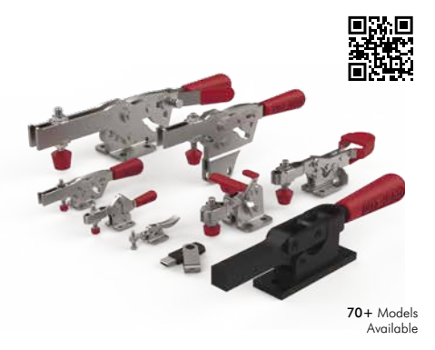
Pull Action Latch Clamps