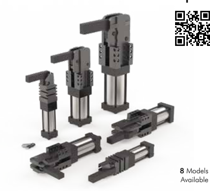
Pin Clamps & Packages, Pivot Units