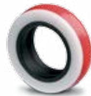
Compact piston seal made of 95 AU 21420/NBR/POM