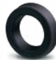
FX*-NI 150 elastomeric rod seal made of 88 NBR 156