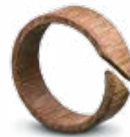
Piston guide ring made of resin-bonded fabric

For quick response, our Freudenberg Xpress facilities are located conveniently near you.