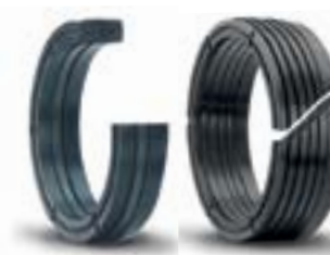
Merkel EK and ES Robust chevron sets designed for older cylinder systems

Guides and roof shaped packing sets are cut to the required sizes and are delivered as open versions. A specially developed bonding technique allows a customizable diameter range for wipers, deflectors and radial shaft seals.