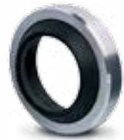
Wiper made of NBR with aluminum case