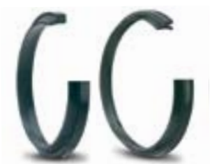
Merkel P 6* and P 9* Wipers with supporting elements or additional sealing capability