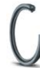
Merkel Enviromatic EA* Innovative deflector for challenging applications