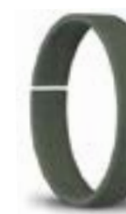
Merkel Guivex SBK and KBK as well as the SB and KB types – guides (resin-bonded fabric)