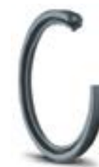
Merkel Radiamatic RPM 41 Radial shaft seal designed for work rolls in steel mills