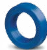
FX*-LF 300 low friction rod seal made of 94 AU 925

* FX: signifies machined standard product series