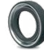
RMS – Rapid Machined Simmerring made of 75 FKM 585