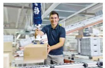
Lifting systems and cranes