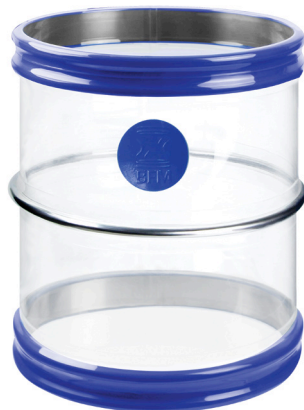
STAINLESS STEEL RINGS