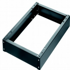
Sample base 4" high x 32" wide x 20" deep

Part number: 0396-WW02-41-17 with WW = 80 for width of 32" / 800 mm WW = 10 for width of 40" / 1000 mm WW = 12 for width of 48" / 1200 mm WW = 16 for width of 63" / 1600 mm WW = 20 for width of 79" / 2000 mm