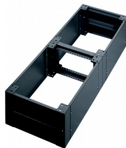
Sample base 8" high x 63" wide x 16" deep (incl. optional base cross-bar)