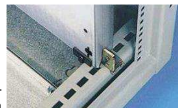
Plastic sliders on rails for easy movement at bottom