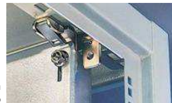
Attachment brackets with "snap-in device" at top