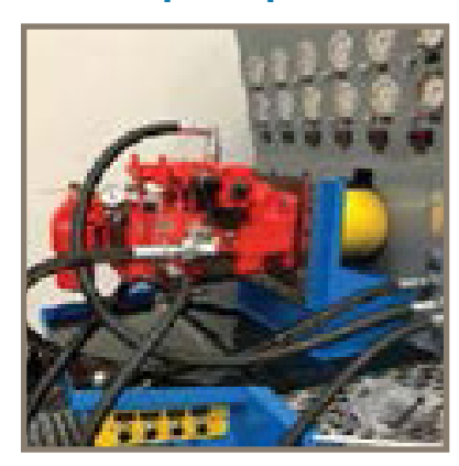
Parker and Linde Hydrostatic Pump/ Motor Repair Specialists