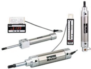
Round Body Cylinders