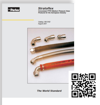
Convoluted PFTE Medium Pressure Hose