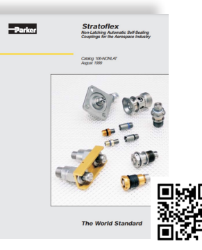
Stratoflex Non-Latching Automatic Self-Sealing Couplings