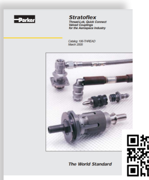
Thread-Lok Quick Connect Valved Couplings