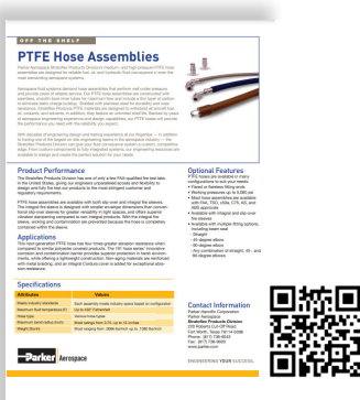
PFTE Hose Assemblies Data Sheet