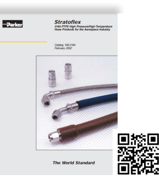
Stratoflex 3164 PFTE High Pressure Hose