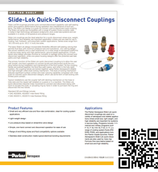
Side-lock Quick Disconnect Couplings