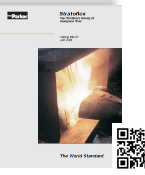
Fire Resistance Testing of Aerospace Hose