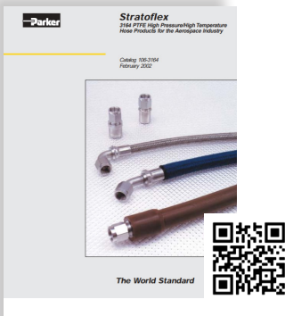
Stratoflex 170 PFTE High Pressure Hose