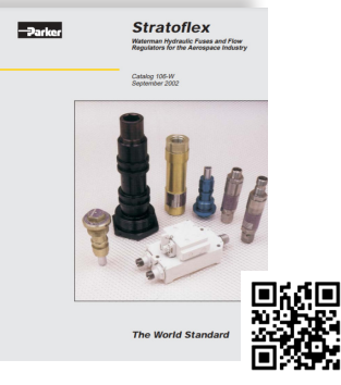
Hydraulic Fuses & Flow Regulators