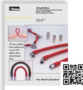
Stratoflex 101 PFTE Light Weight Hose