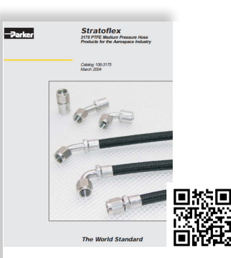
Stratoflex 3175 PFTE Medium Pressure Hose