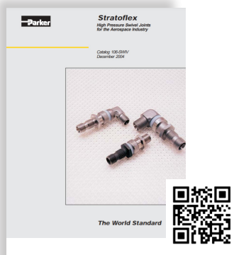
Hydraulic Pressure Swivel Joints