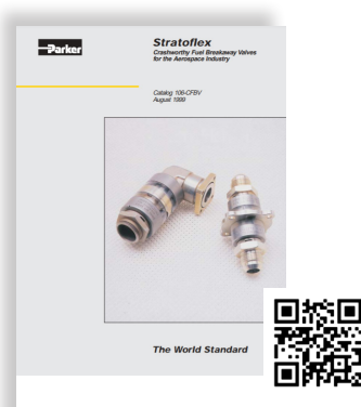
Crashworthy Fuel Breakaway Valves