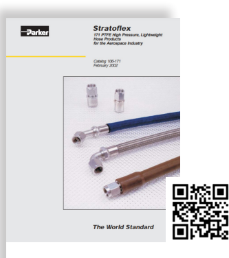
Stratoflex 171 PFTE Light Weight Hose