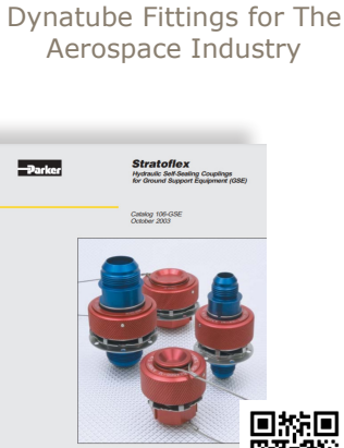
際の The World Sta Stratoflex Hydraulic Self-