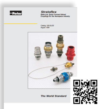
Side-lok Quick Connect Valved Couplings 106-Slide