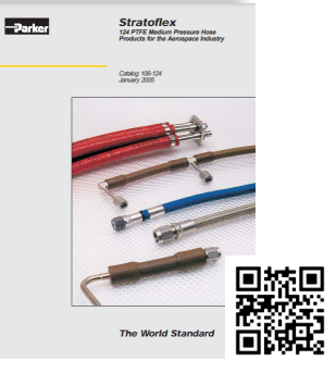
Stratoflex 124 PFTE Medium Pressure Hose